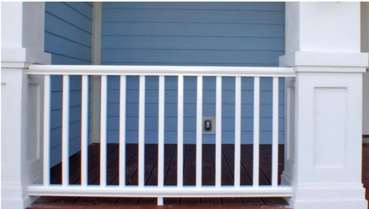
Figure – examples of guardrails