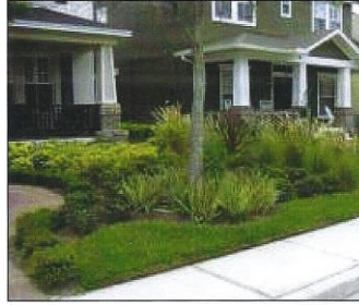
Example of Xeriscape Design with bands of sod